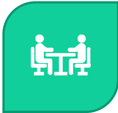
LOCAL HUD FIELD OFFICE