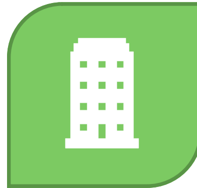
HUD HEADQUARTERS STAFF