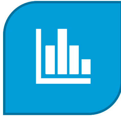
MTW PLANS/REPORTS OF OTHER AGENCIES